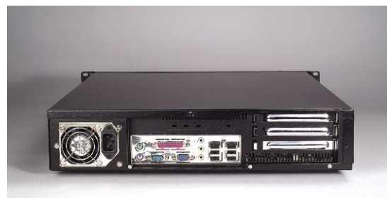
The rear view of ACP-2320MB