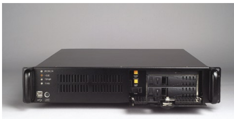
The front view of ACP-2320MB