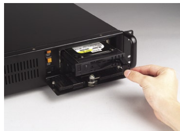
Dual easy-to-maintain SATA HDD trays